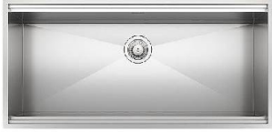
Sink Leonardo 40" x 20" – U/M 1015 660